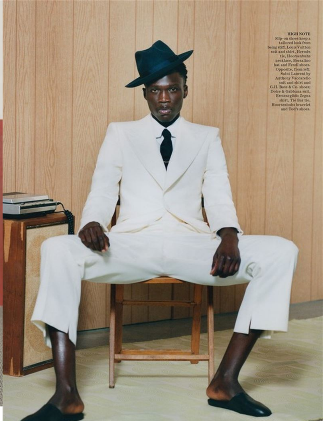
HIGH NOTE Slip-on shoes keep a tailored look from being stiff. Louis Vuitton suit and shirt, Hermès tie, Hoorsenbuhs necklace, Borsalino hat and Fendi shoes. Opposite, from left: Saint Laurent by Anthony Vaccarello suit and shirt and G.H. Bass & Co. shoes; Dolce & Gabbana suit, Ermenegildo Zegna shirt, Tie Bar tie, Hoorsenbuhs bracelet and Tod's shoes.