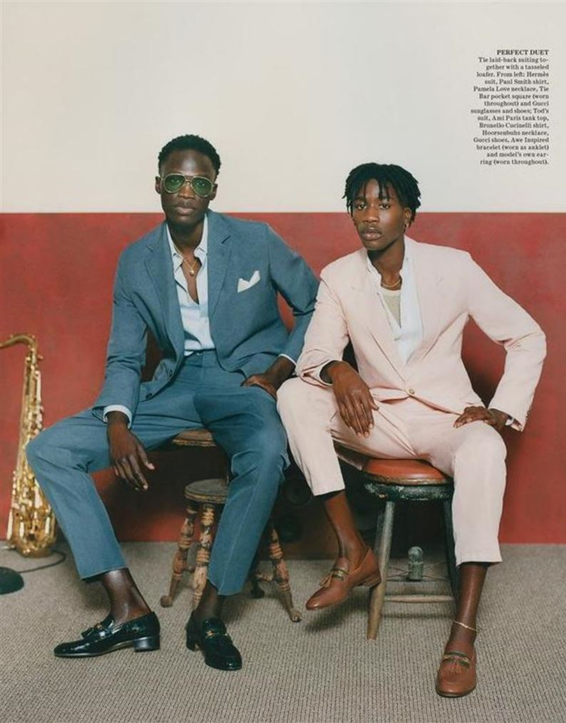
PERFECT DUET Tie laid-back suiting together with a tasseled loafer. From left: Hermès suit, Paul Smith shirt, Pamela Love necklace, Tie Bar pocket square (worn throughout) and Gucci sunglasses and shoes; Tod's suit, Ami Paris tank top, Brunello Cucinelli shirt, Hoorsenbuhs necklace, Gucci shoes, Awe Inspired bracelet (worn as anklet) and model's own earring (worn throughout).